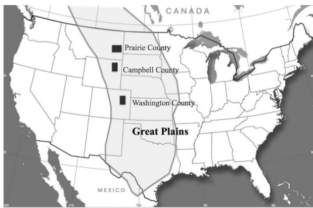
Figure 1. A map illustrating the general locations of the three study areas in the investigation

One county in each of the three states located in the general study area were selected for model development: Prairie County, Montana; Campbell County, Wyoming; and Washington County, Colorado (Fig. 1) [24]-[28]. Each of the counties are situated in the northwestern portion of the American Great Plains, a dry mid-continental steppe landscape with temperatures as low as winter as -30 degrees C., and in summer temperatures often exceeding 30 degrees C., with yearly rainfall often below 30 inches (75 cm) and sometimes less than 90 frost free days in the summer [24]. The Atlas of the Great Plains provides additional information concerning the geography of the area [29].